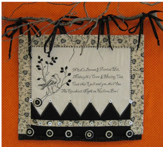
Crabapple Hill's Fall/Halloween stitching.