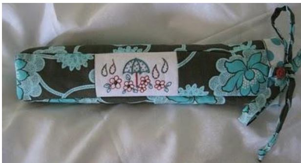
Rainy Day Umbrella Cover